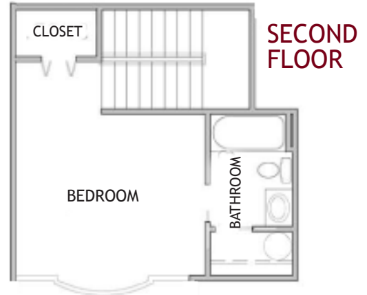
Mt. Rainier View